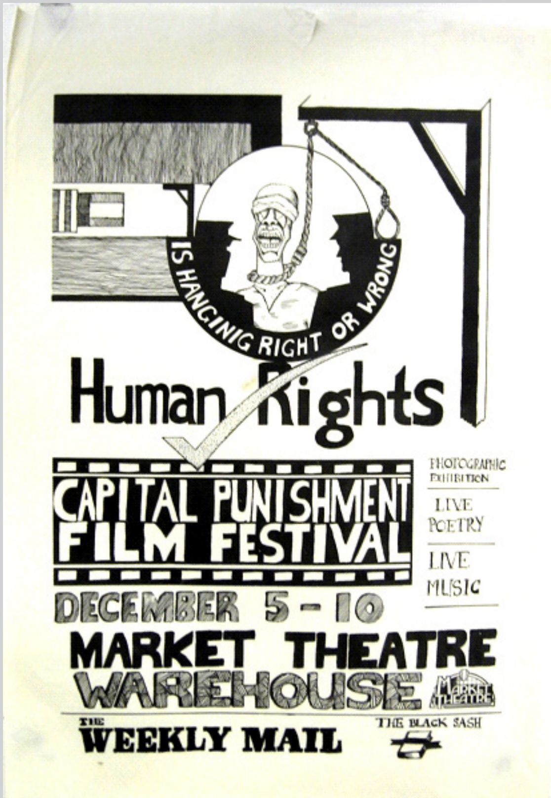
Poster: Offset litho, issued by the Weekly Mail and Black Sash, date unknown.